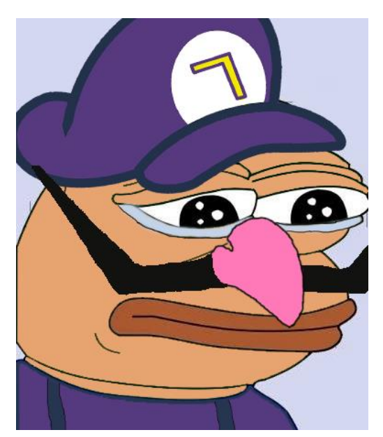
Figure 2 "Waluigi as Pepe the Frog," source: https://i.imgur.com

seen shapeshifting into the likeness of an eternally weeping Pepe the Frog, whose popularity stems from Matt Furie's 2005 comic Boy's Club (figure 2). As Mike Wendling, author of Alt-Right: From 4chan to the White House observes, Pepe is none other than a "mascot of the alt-