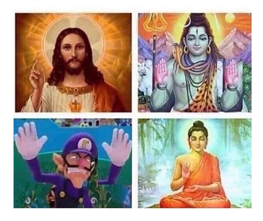
Figure 8 "What's up with Gods holding their hands up?"

Nintendo has likely missed its window of opportunity to deter alt-light groups from incorporating Waluigi's likeness as part of their political campaign. Further research would be required to determine whether the impact of these culturally profound memes is in fact, detrimental to Nintendo. Is there room for Nintendo to breathe new life back into Waluigi as the fourth player in a harmless game of tennis or in a heroic jaunt through Mushroom Kingdom? The quickest answer is no. Waluigi, drowning in a sea of memes and a void of representation, might not resuscitate from the subcultural myths or "dankness" that surrounds the avatar. As a symbol for the carnivalesque, a space of inverted political colouring and grotesque ideologies, Waluigi is on a polychromatic pathway (or Rainbow Road) to alt-right groups through the soft power of altlight sensibility. It is on this pathway that Wahmunism can be accessed. Ready Player Four?