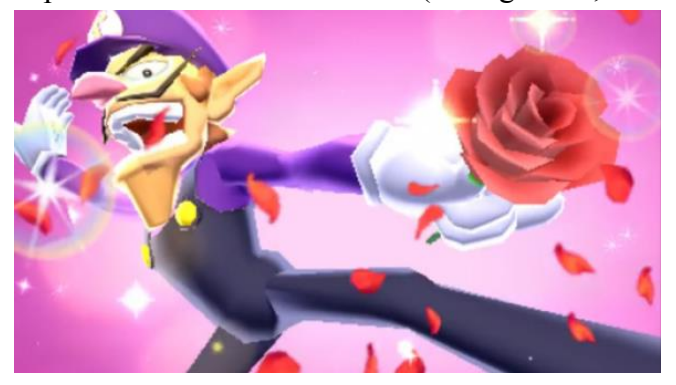
Figure 4 "Waluigi the god of romance,"