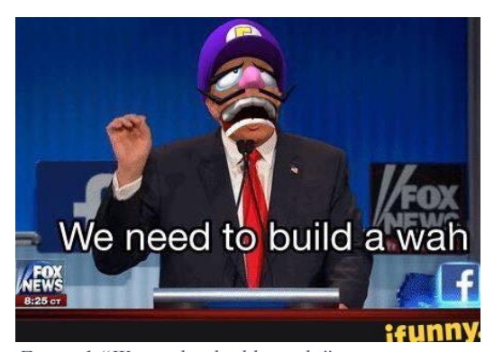
Figure 1 "We need to build a wah," source: https://i.pinimg.com/

The catchphrase 'It's Waluigi time' is ubiquitous on Tumblr. Waluigi revisionism is very real, but ultimately harmless."1